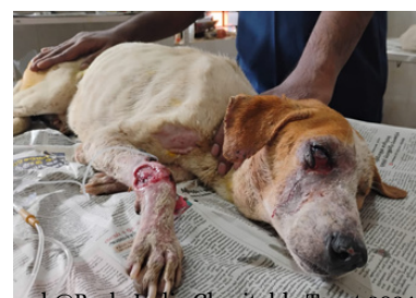
All rights reserved @Bark India Charitable Trust.202