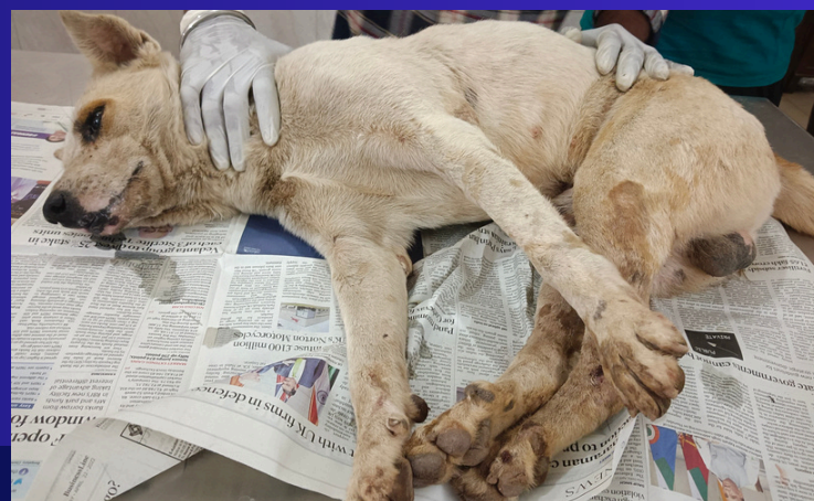
Poisoned stray dog