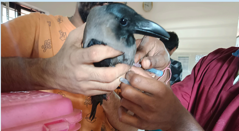
Crow rescued with broken wing