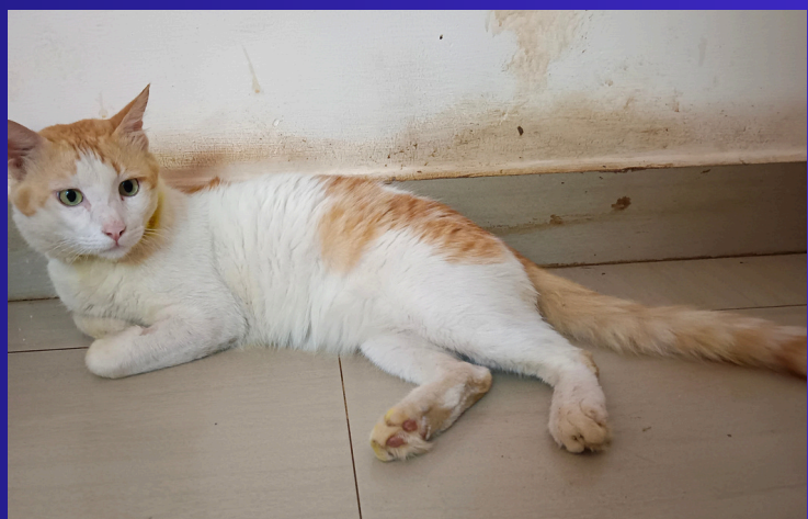
Rescued cat with cut wound on face