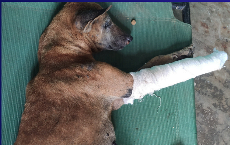
Accident victim- after front leg pinning surgery