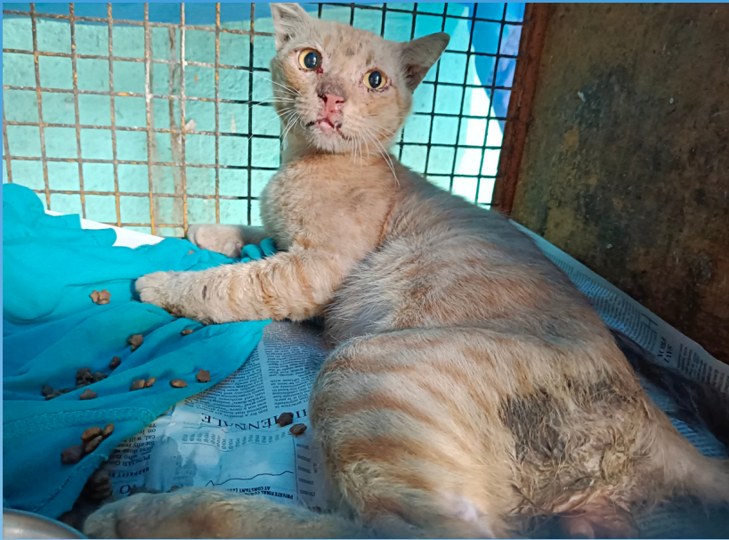
Cat that had accident and wounded leg