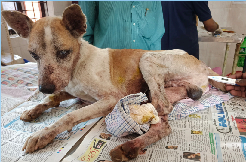
Dog that had accident, leg wounded