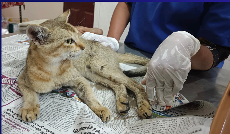
Spinal injury-cat hit by a vehicle