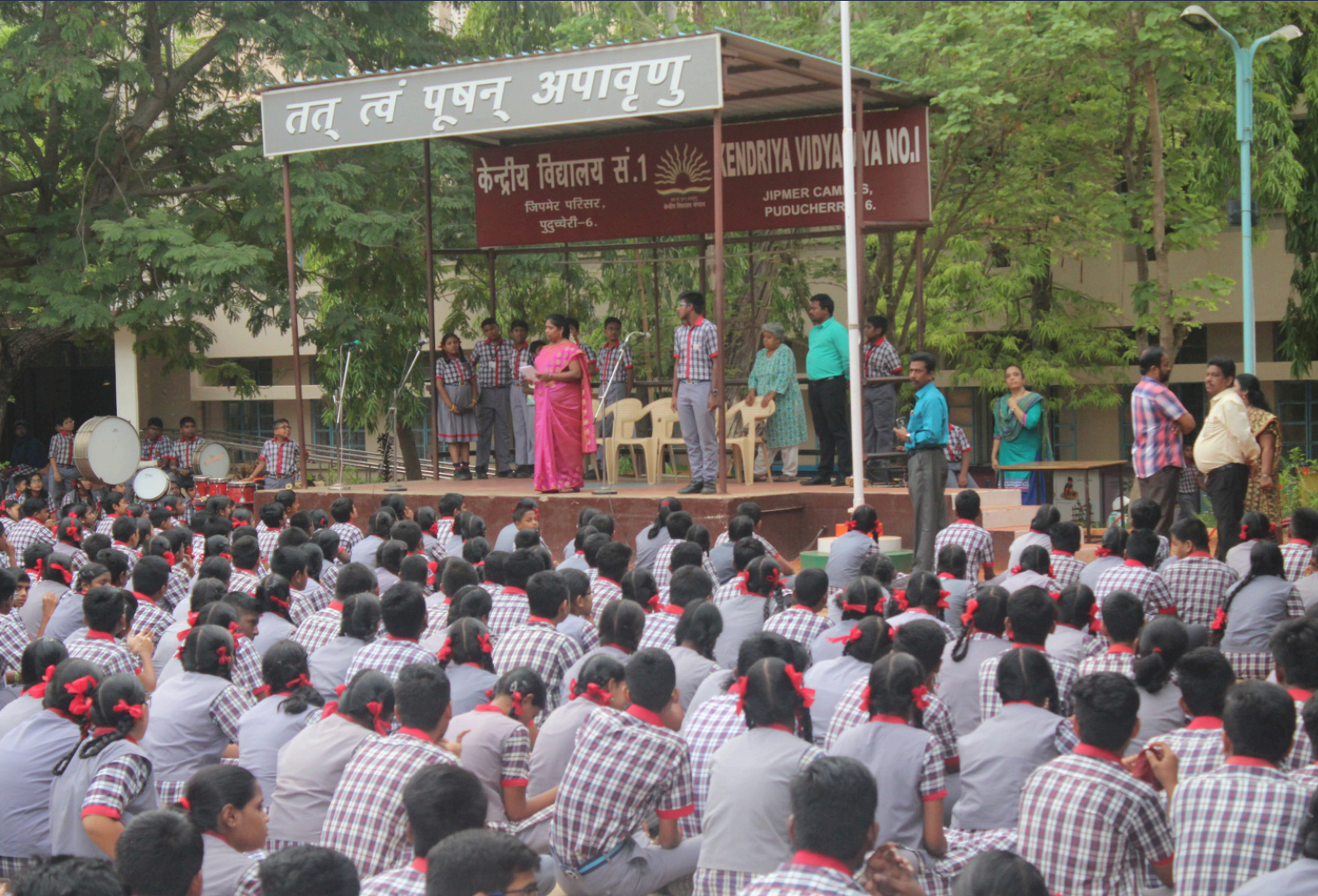
(Representative image from Bark India awareness programme)

School awareness campaigns has been one of our major programmes that we always want to focus on. Investing knowledge in the future generation is the most effective way to create a better society.