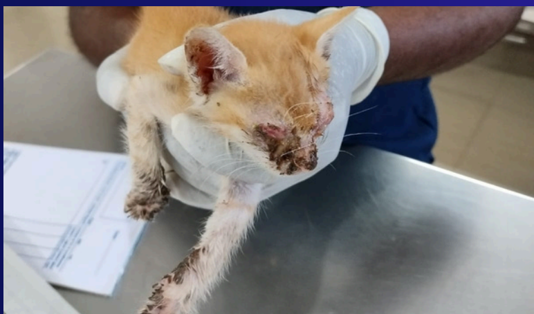
Kitten with lethargy and eyes infection