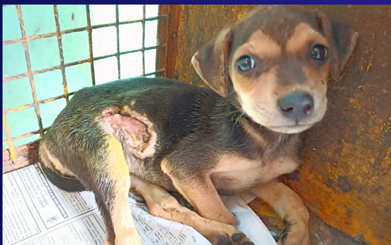
Puppy rescued with myiasis on stomach