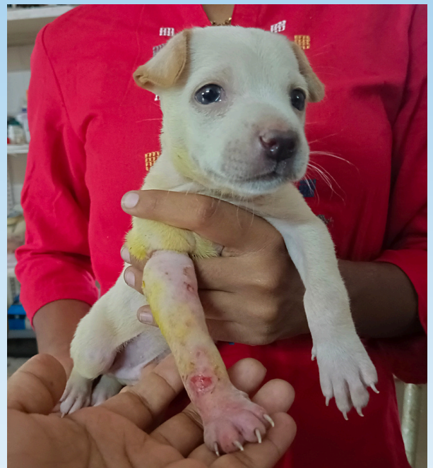
Little puppy rescued with front leg fracture