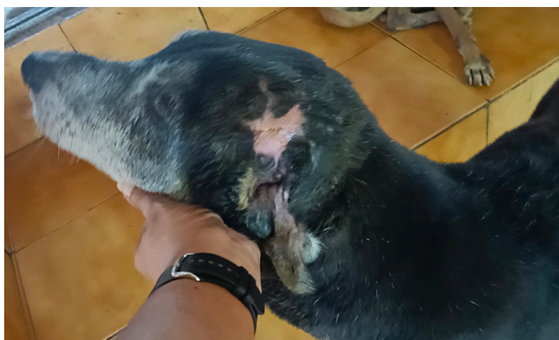
Random pictures of some rescue cases- before and after treatment