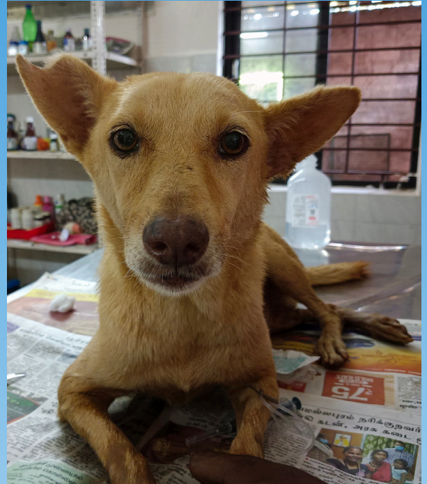
Rescued dog with hyperthermia