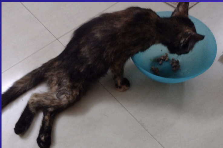
Dog bitten kitten-paraplegic hind legs