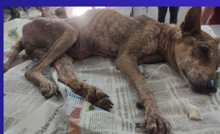
An aged dog with kidney and liver failure